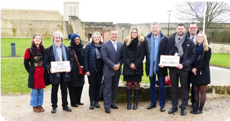
The organisation team gathered in the heart of Caen, inside the Dukes of Normandy Castle.